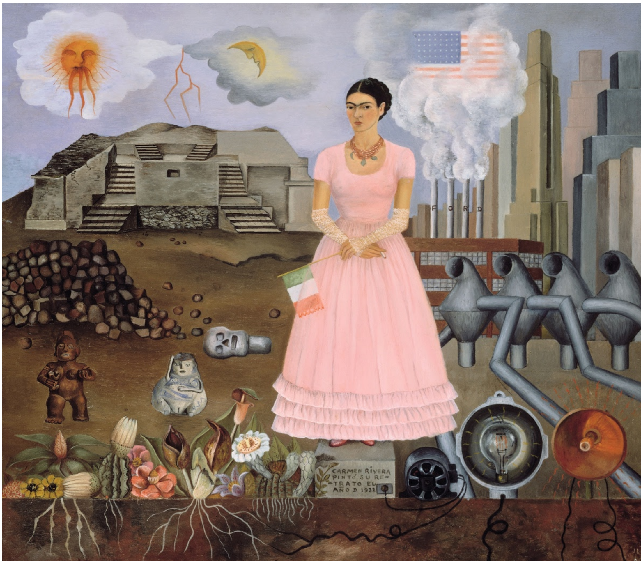
Frida Kahlo Self Portrait along the Borderline between Mexico and the United States of America 1932 Oil on canvas