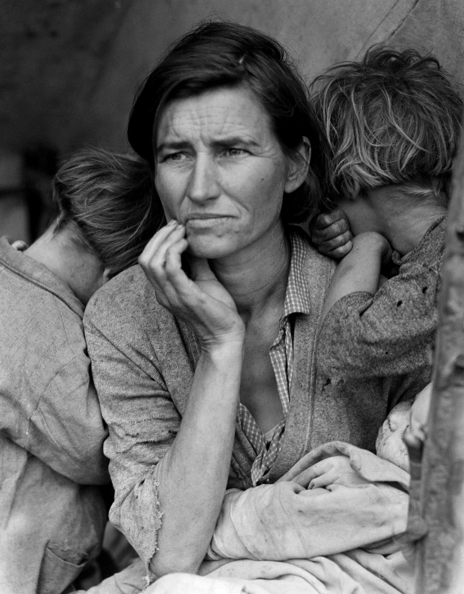
Dorothea Lange Migrant Mother, Nipomo, California 1936 Photograph