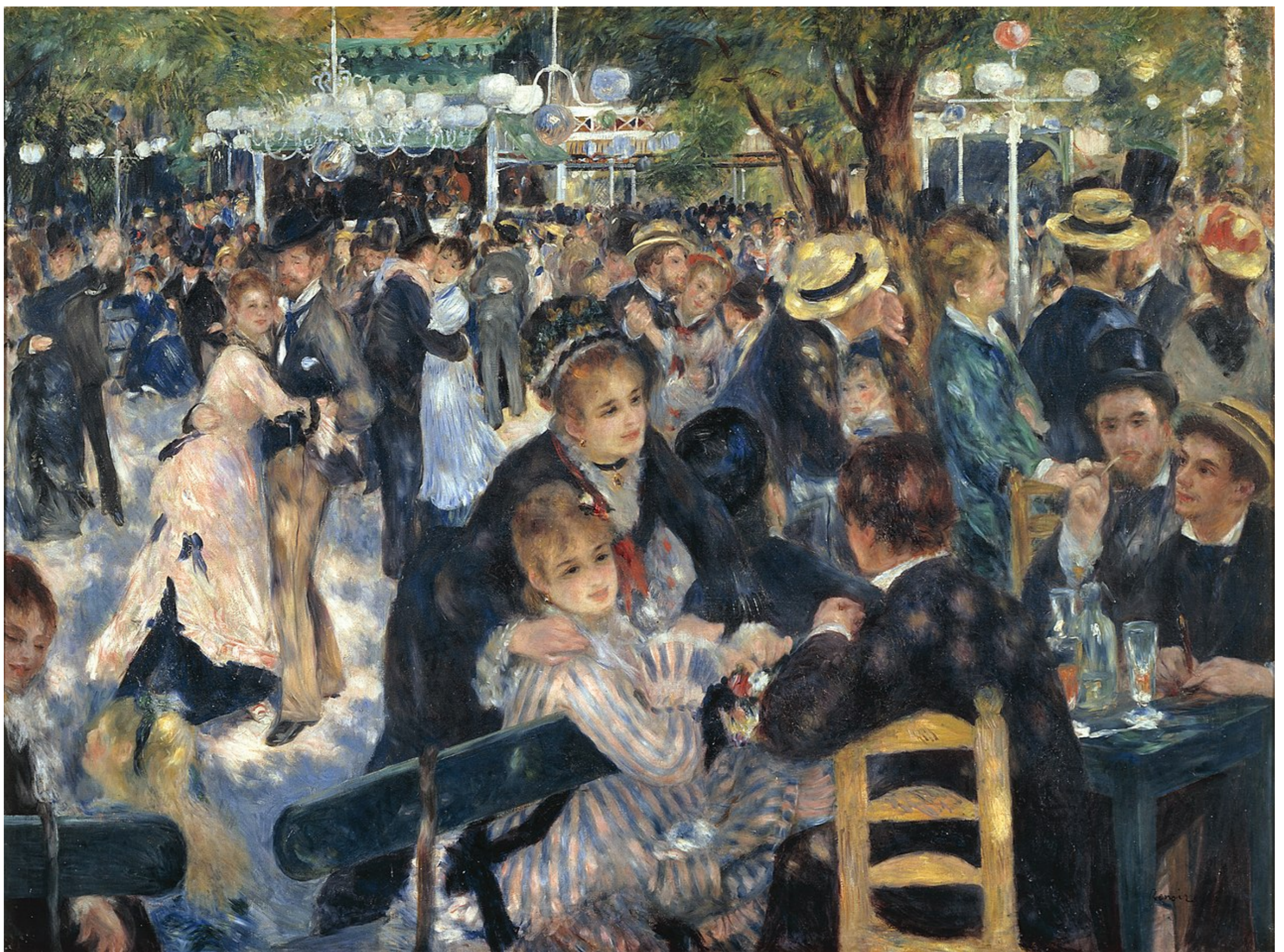
Pierre-Auguste Renoir Moulin de la Galette 1876 Oil on canvas