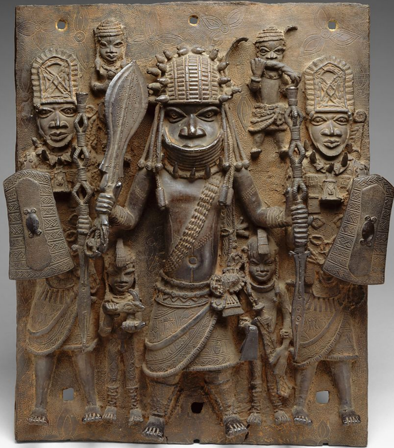
Plaque: Warrior and Attendants 16th-17th century Edo Peoples, Nigeria Brass