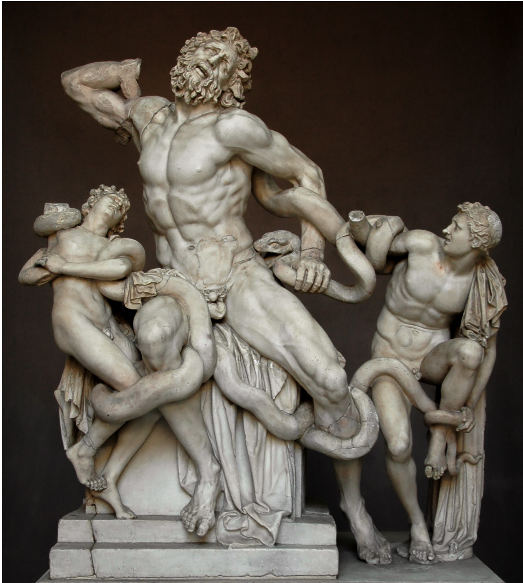
Laocoön and his sons c. 200 BC Marble