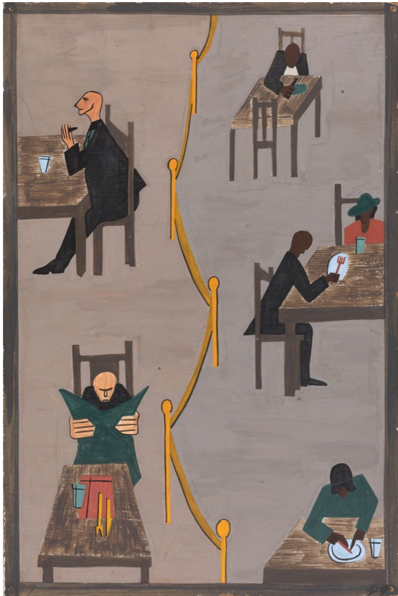
Jacob Lawrence The Migration Series, Panel no. 49: They found discrimination in the North 1940-1941 Casein tempera on hardboard