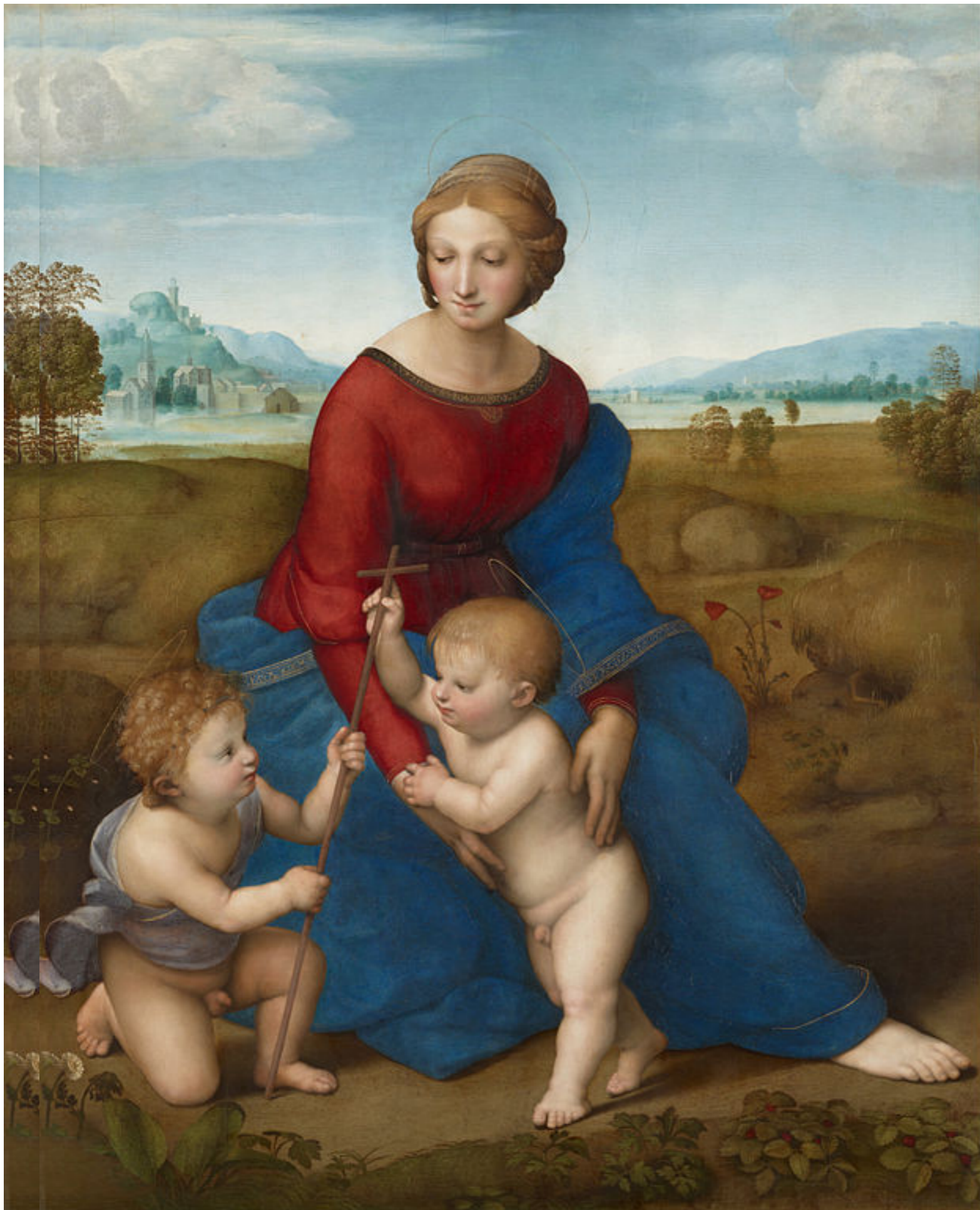
Raphael Madonna in the Meadow 1505-06 oil on wood